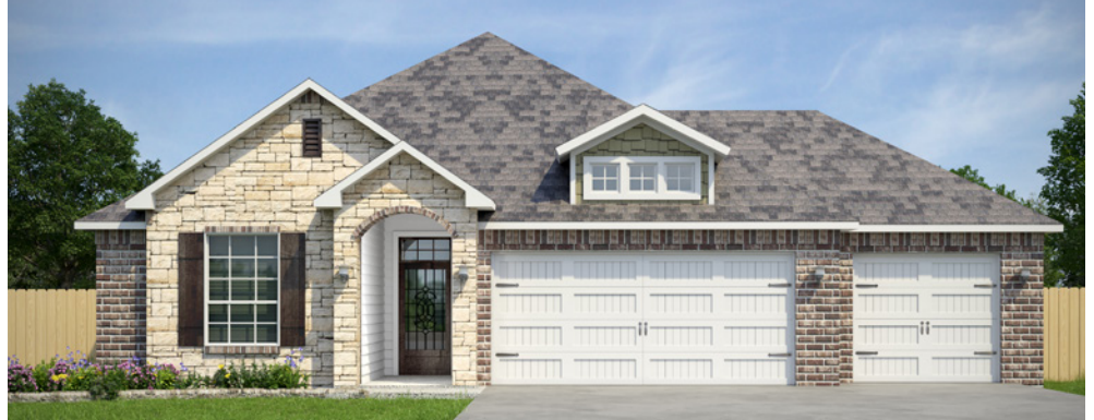
the Holly 150

the Holly 2148 sqft 4 Bedrooms 2 Bathrooms