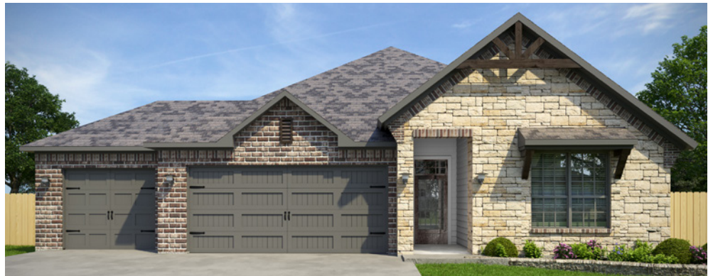
the Holly 450