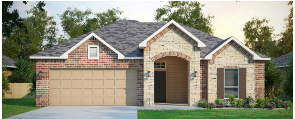
the Morgan 300