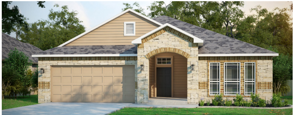
the Morgan 200