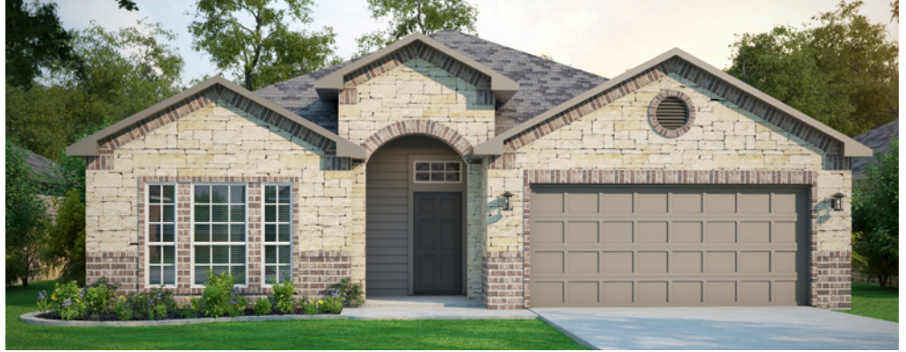
the Morgan 100

Elevation designs available for the Morgan: