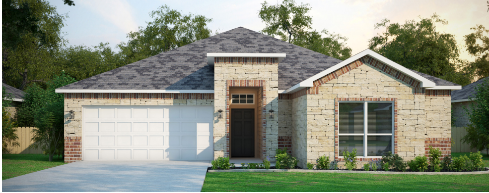
the Griffon 100

Elevation designs available for the Griffon: