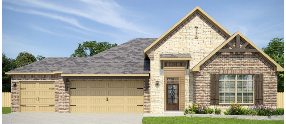
the Drake III 150

the Drake III 2171 sqft 3 Bedrooms 2 ½ Bathrooms