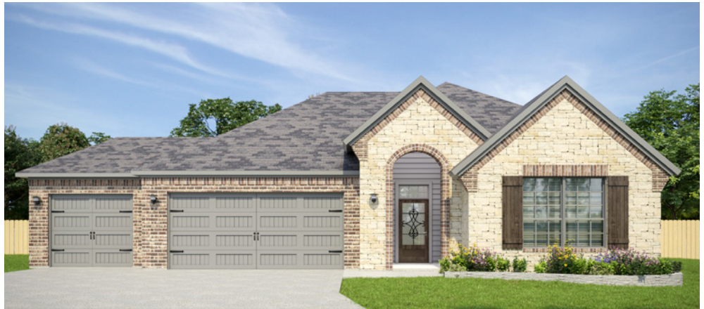
the Drake III 250