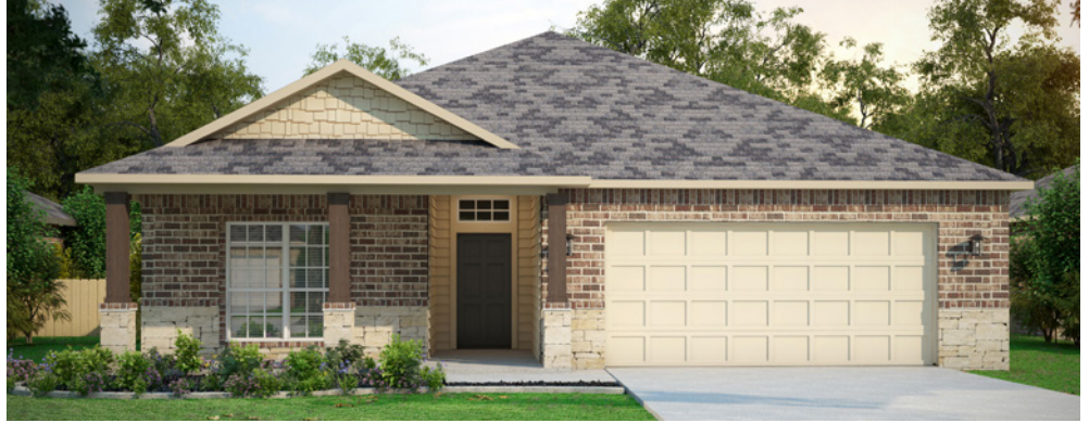
the Porter 100