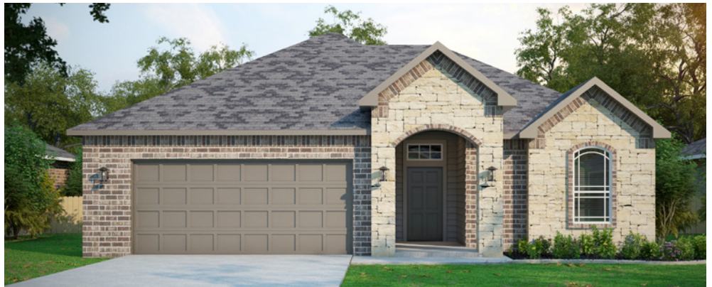
the Porter 300