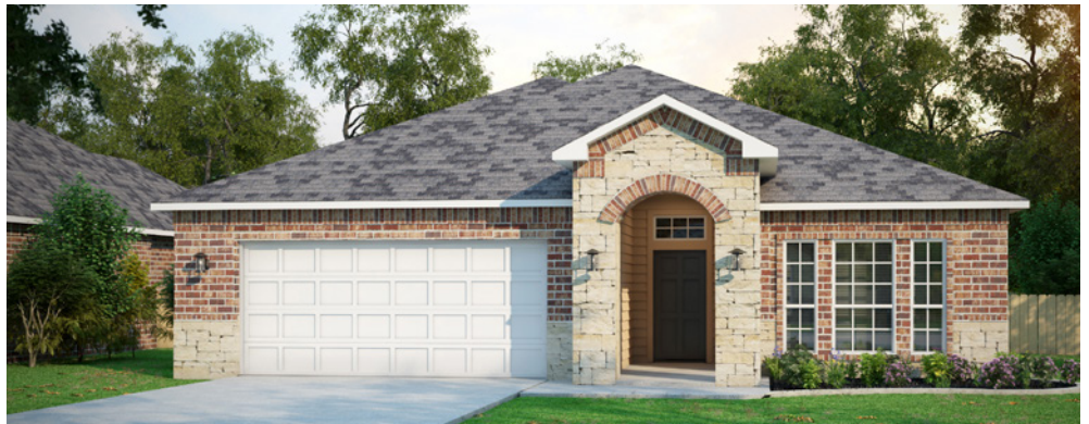
the Porter 200