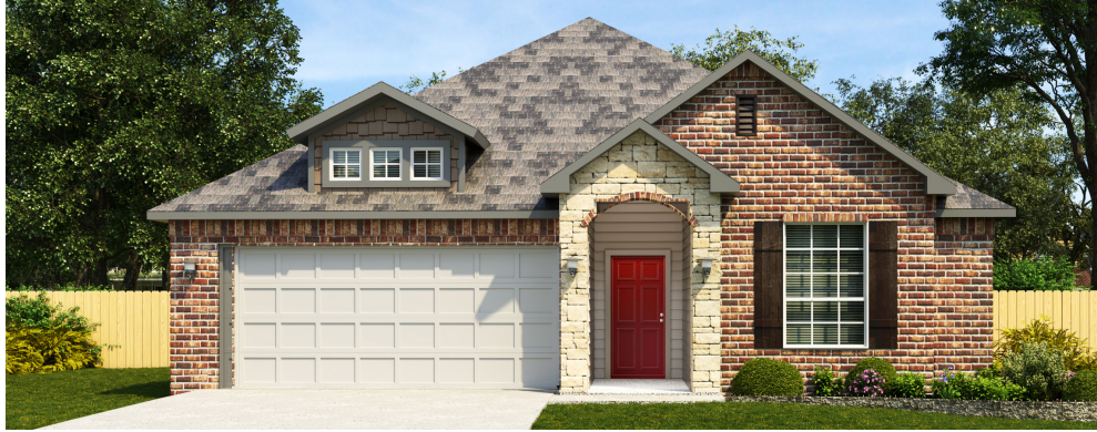
the Westin 150

Elevation designs available for the Westin: