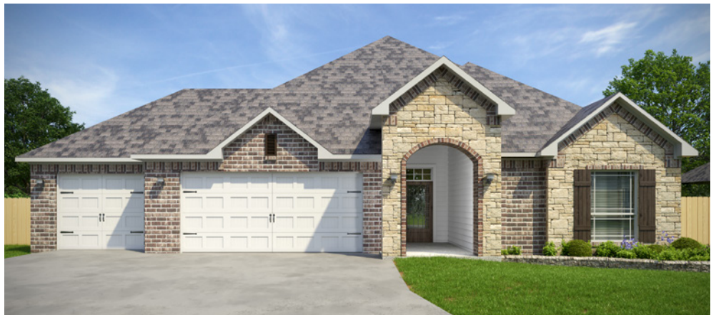
the Carrington 350