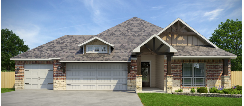
the Carrington 150

Elevation designs available for the Carrington: