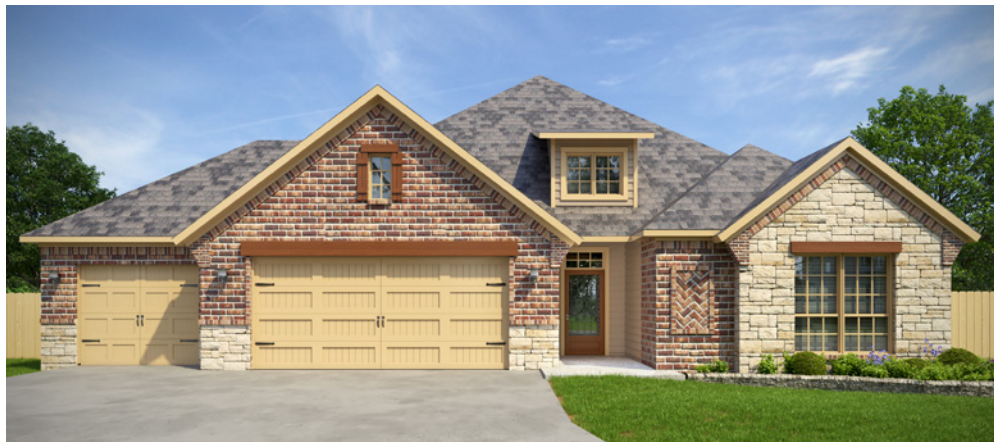
the Carrington 250