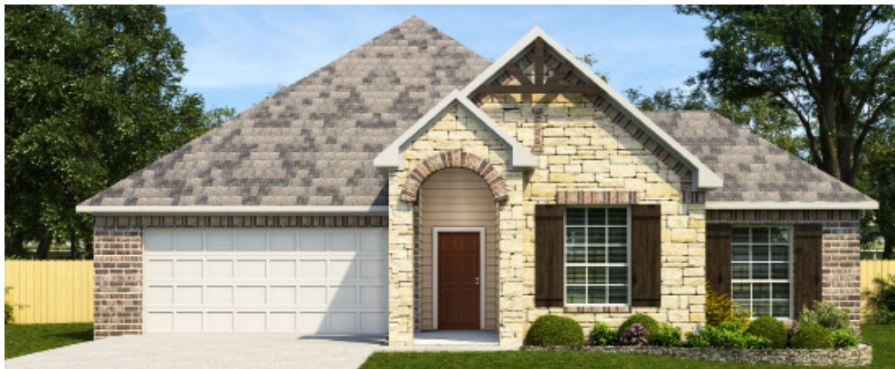
the Darby 350