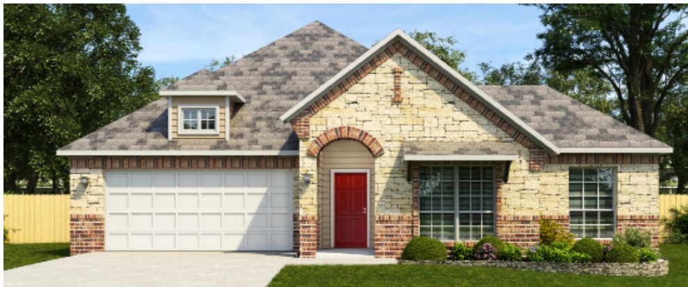
the Darby 250