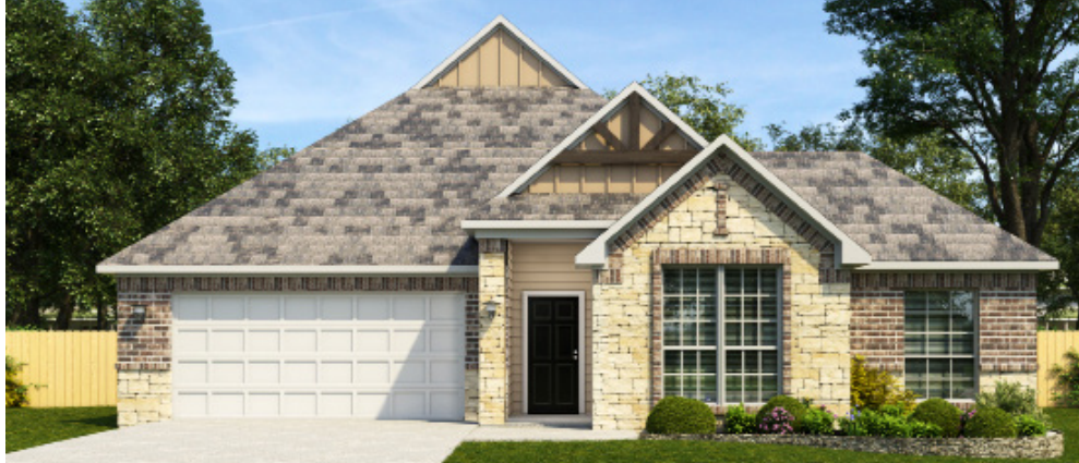
the Darby 150

Elevation designs available for the Darby: