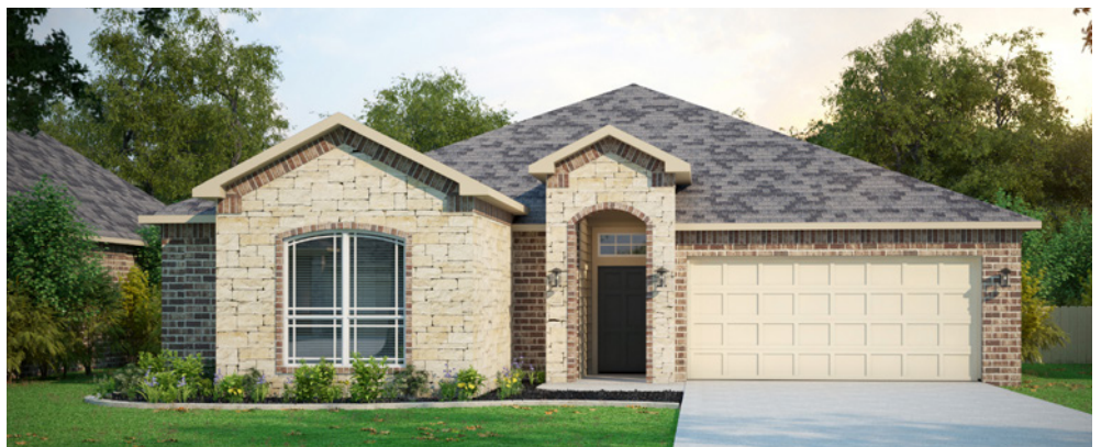
the Griffon 300