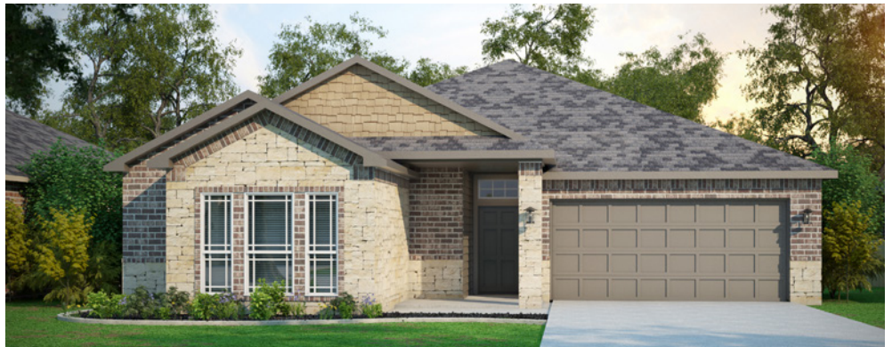
the Griffon 200