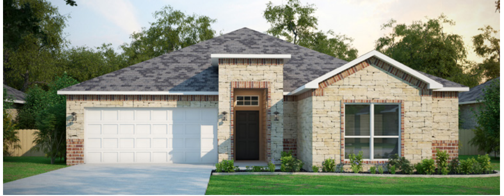
the Griffon 100

Elevation designs available for the Griffon: