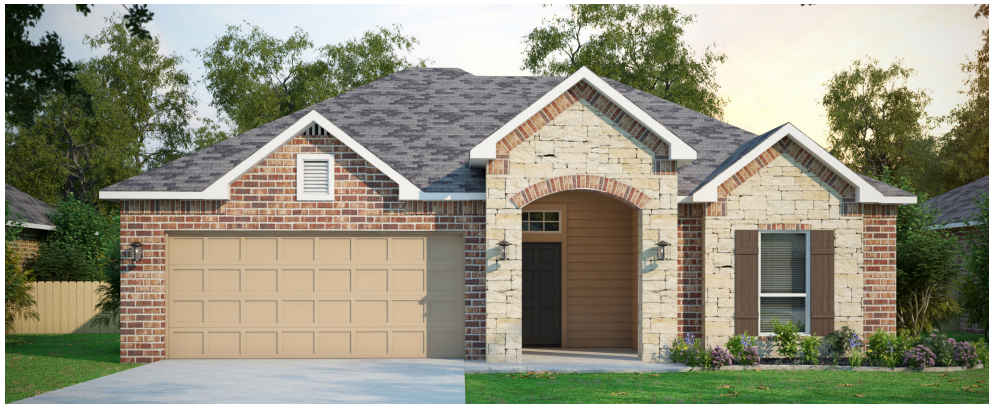
the Morgan 300