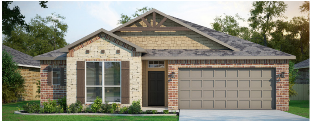
the Bower 200