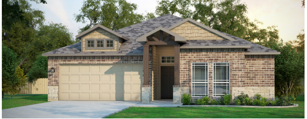
the Bower 100