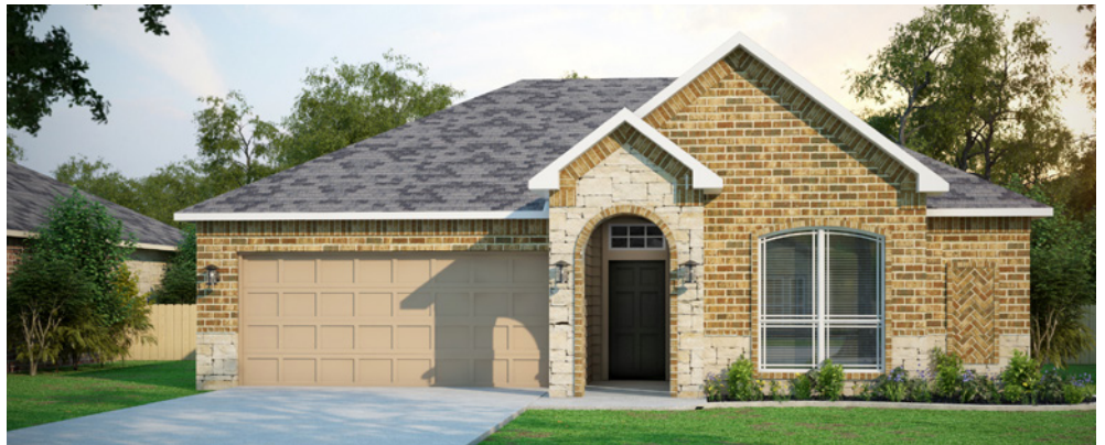
the Bower 300