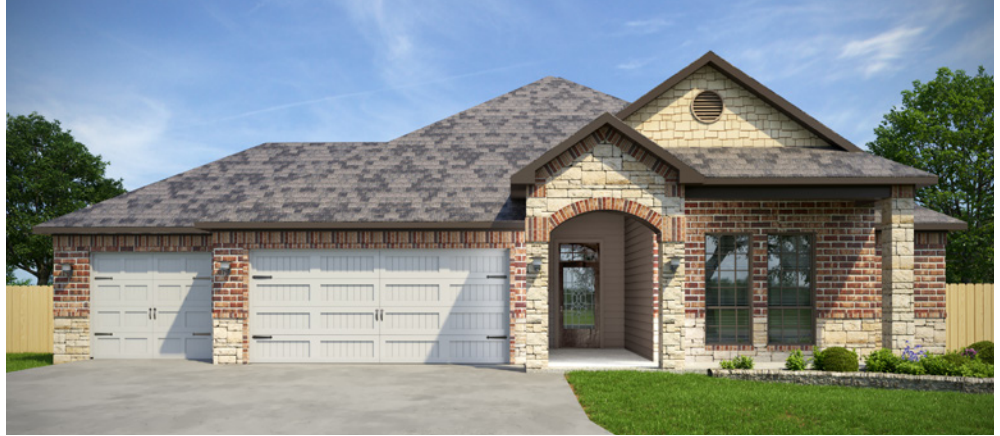
the Everhart 150

Elevation designs available for the Everhart: