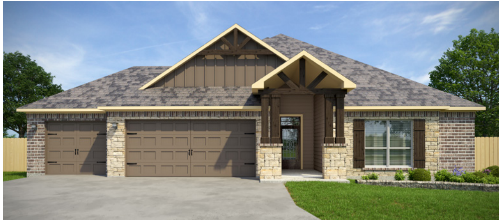
the Everhart 350