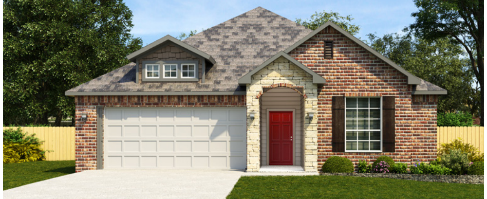
the Westin 150