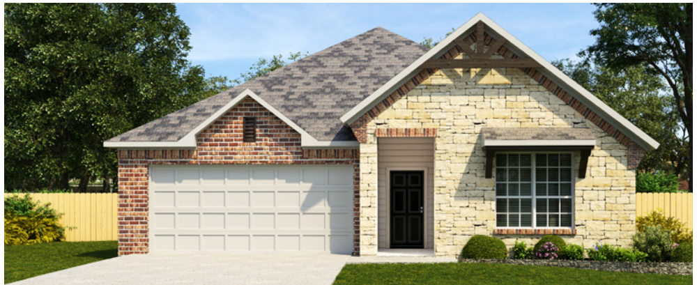
the Westin 450