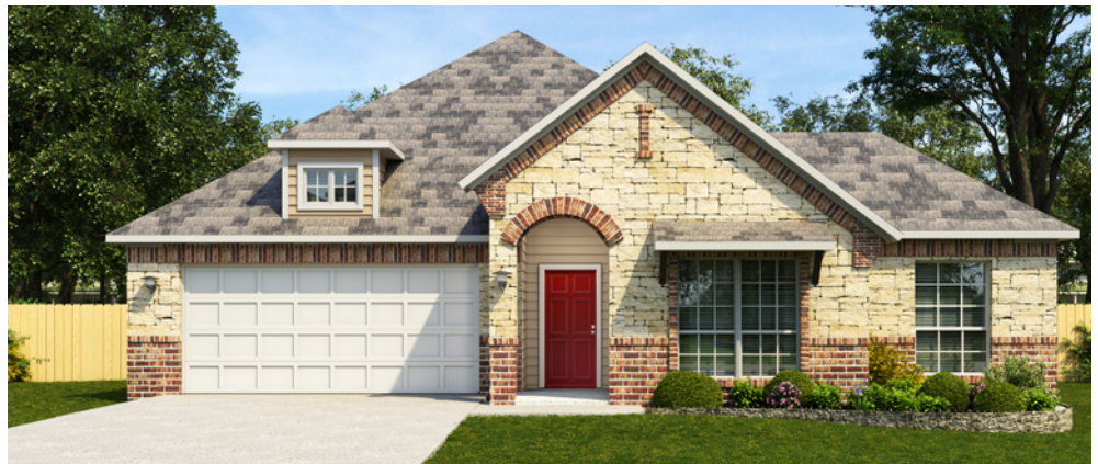
the Darby 250