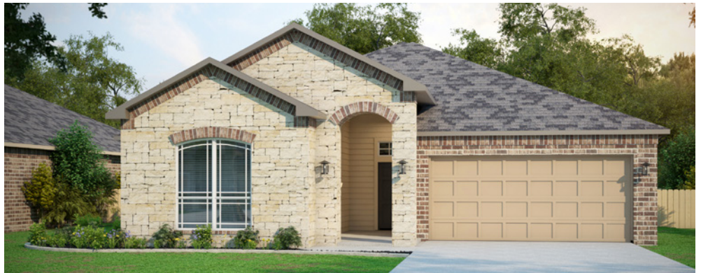
the Rivington 200