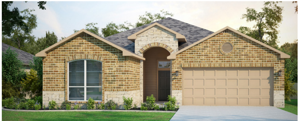
the Rivington 300