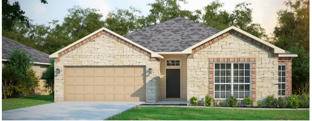
the Rivington 100

Elevation designs available for the Rivington: